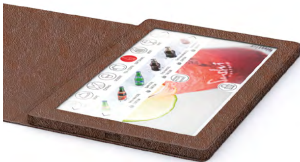
E-Menu leather card