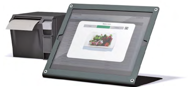
Kitchen station with printer

Orders can be routed to different kitchens/bars and stations, depending on the item and time of operation.