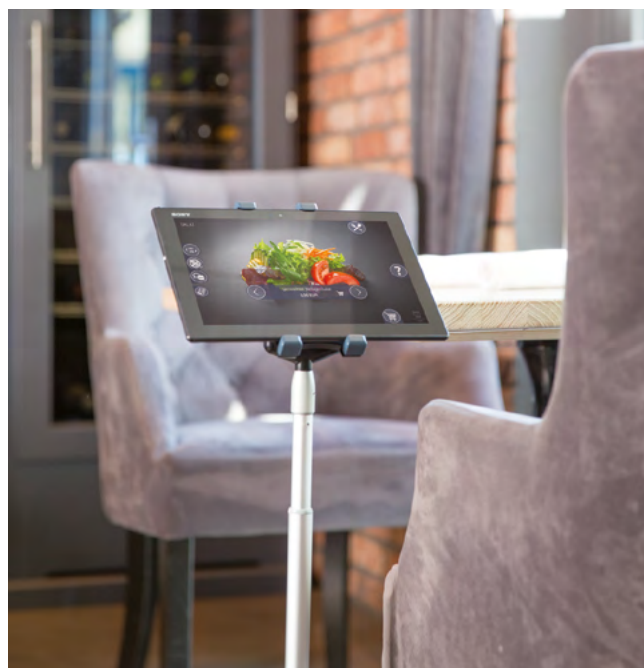
Order terminal with easy stand

The Food-Order-Terminal is based on the OktoPOS system. OktoPOS is the technology leader in POS systems for restaurants since 1998. We have installed more than 1,000 Order Terminals in Europe and Asia and the number is growing.